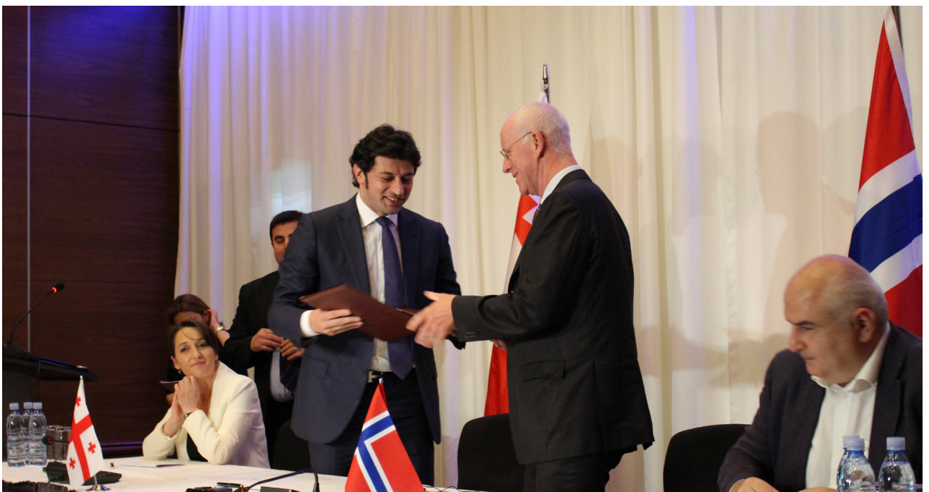
Signing of agreement between Ministry of Energy and NVE (Minister of Energy, Mr. Kaladze and Mr. Sanderud, Director General, NVE)

Contract value/Duration: NOK 13.680.000 - started in June 2013 and ends in June 2016.