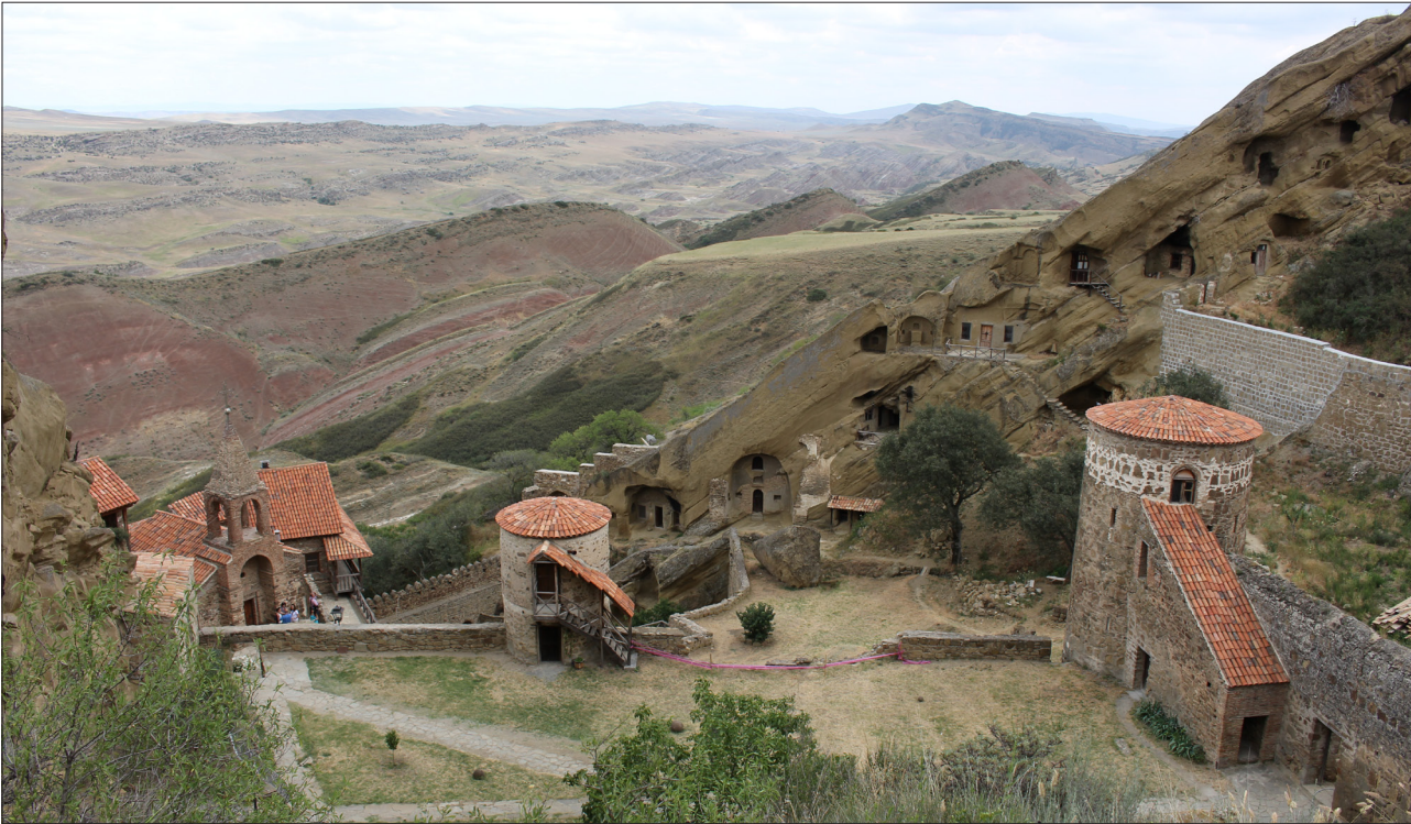
David Gareja, a monastery on the border between Azerbaijan and Georgia, founded in the 6th Century